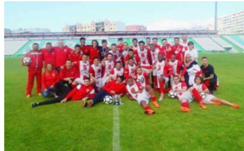
Portugal - Trophies won in national competition.