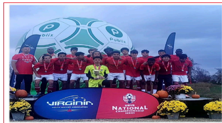
USA - Benfica Soccer School Washington DC Virginia State Cup Under-19 Finalist 2022/2023

My goal is to leave a lasting impact on the lives of the players I mentor.