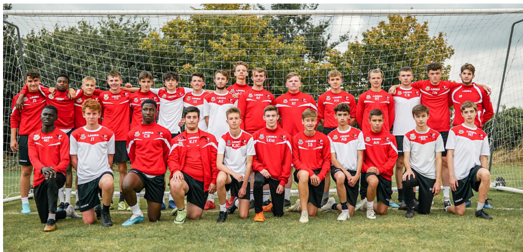
Academy Squad 2019-2020

The Academy will hold Trials for next season 2020/21 at the Belmont on 23 rd . October. The trial will be from 6:00 pm. until 7:30 pm. The trials will be open to years 11,12 and 13 (that is 16 to 18 years old.) Get in touch with the Football Club.