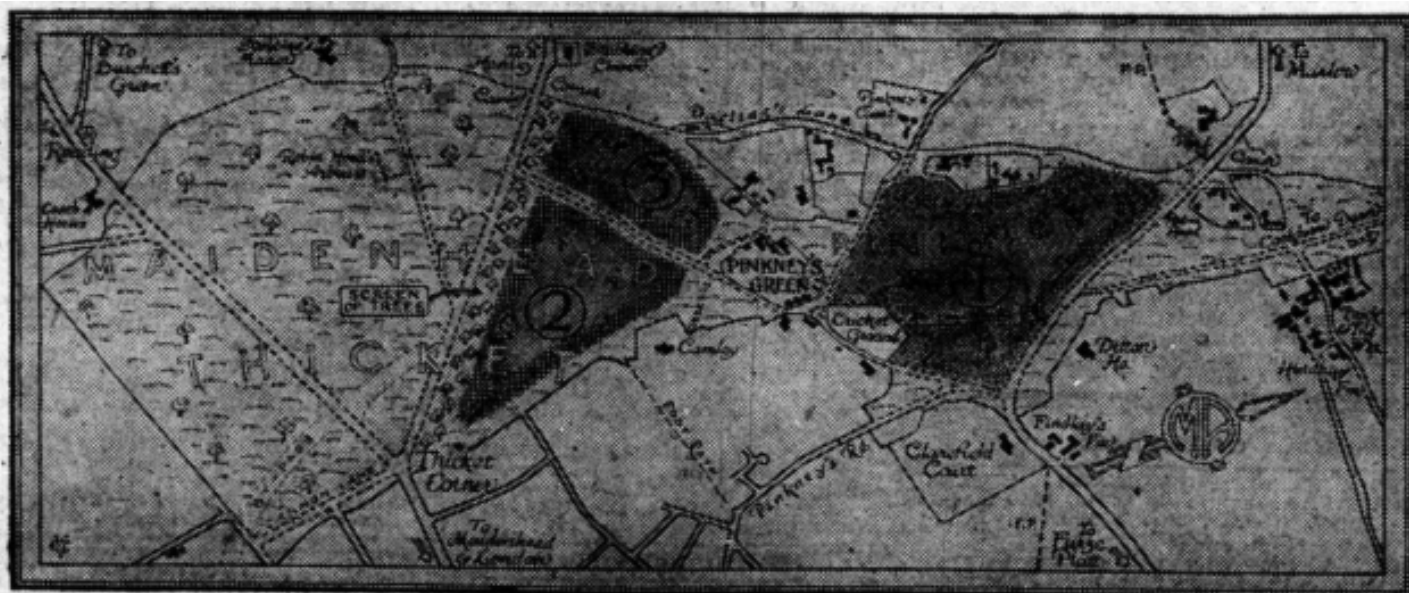
"Advertiser" Map Maidenhead Thicket and Pinkneys Green showing sections (shaded) taken over by County War Agricultural Committee.