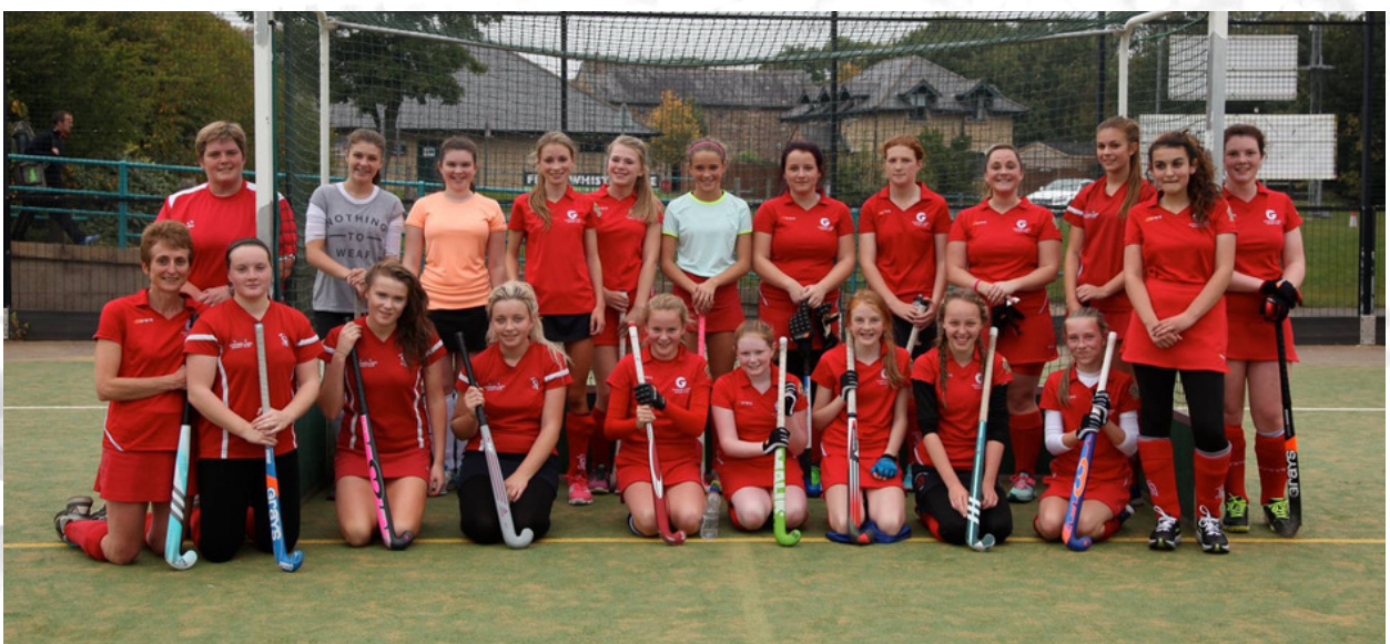
2015 Oct - 3rd Team with a 4th 'development' Team