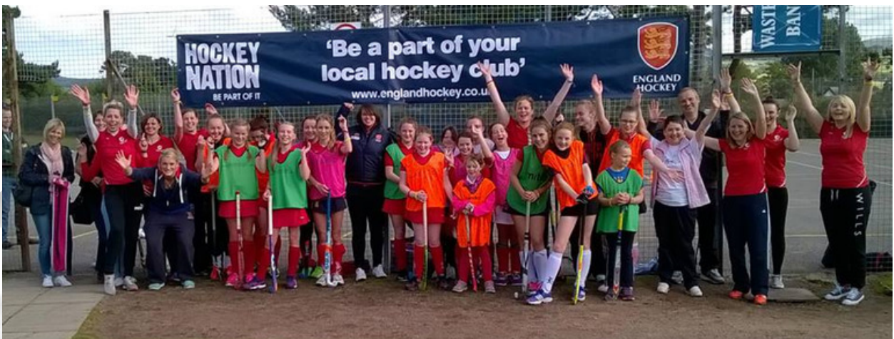
2015 Sept - HockeyFest at Garstang Community Academy

New Grays playing kit sponsored by 'SuperSports' and leads to the 'Double Double season' where the 1sts bounce back to Regional hockey at the first attempt, the 2nd Team are also promoted and both win their respective Cups.