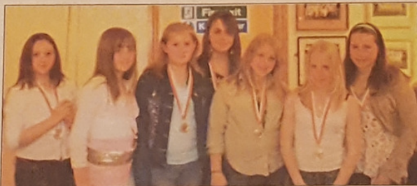
RIGHT: Members of the U13s team.

THE hockey season hasn't even started yet, but it's all happening at Garstang Ladies Hockey Club.