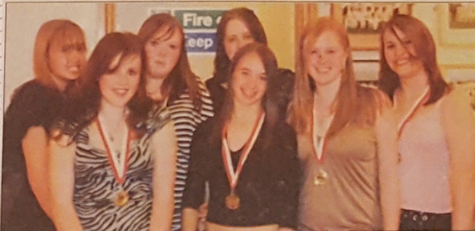
ABOVE: Garstang Hockey Club's U16s team at the awards night.