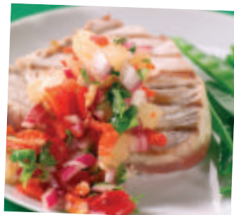
Low GI slow energy release ...