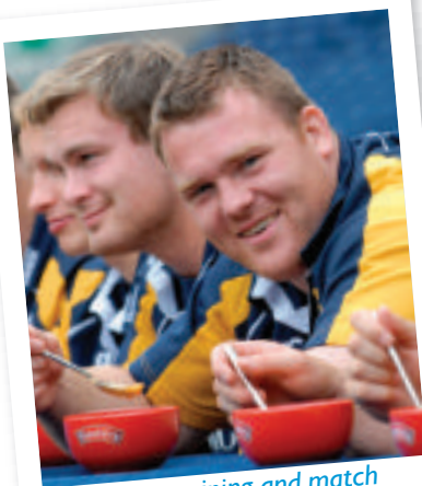
Follow training and match nutrition goals ...