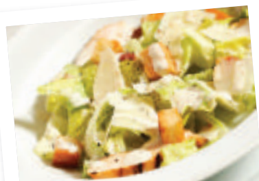
Iron-rich green salad with meat ...

High training demands will increase the body's requirements for antioxidants. Sources include brightly coloured fruit and vegetables, tea, red wine (in moderation!), nuts and seeds, wholegrain cereals and pulses.