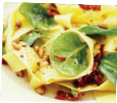
Carbohydrate is the primary fuel...