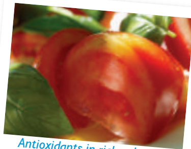
Antioxidants in rich coloured fruit and vegetables ...