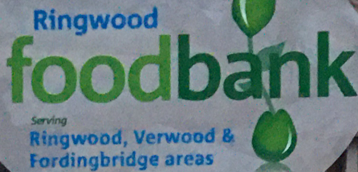
Top: Bread is donated by Lidl to the Foodbank 3 times a week.