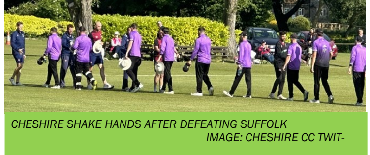
CHESHIRE SHAKE HANDS AFTER DEFEATING SUFFOLK