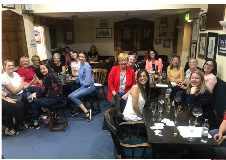
Above - The ladies enjoy the first Colour & Wine evening.