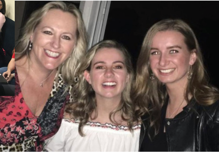
Below - A great night had by all at the Bangerz n Mashups event.