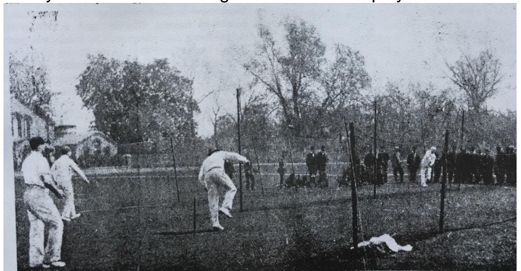
The 1880 Australian touring party at practice on the Green