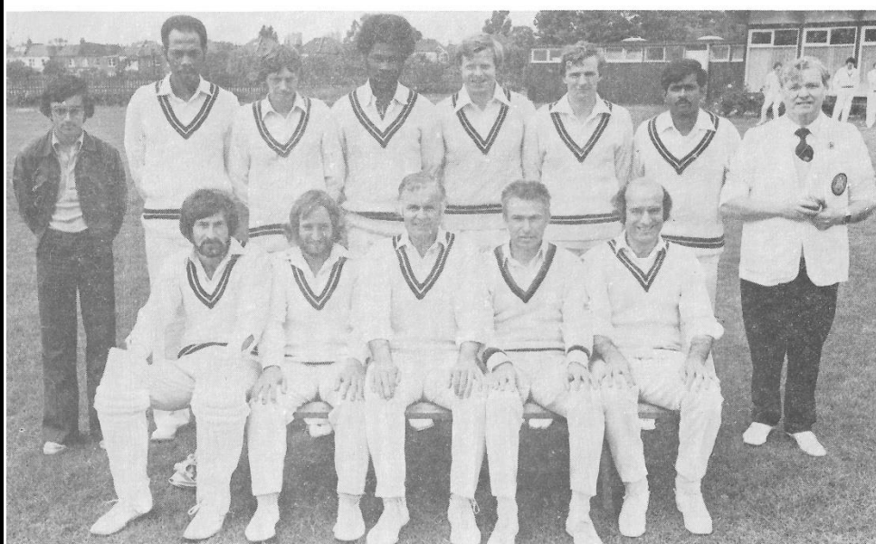
MITCHAM 1st XI 1978