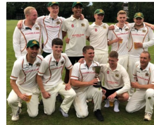
Poynton (left) and Oakmere 2s (beneath) celebrate cup triumphs