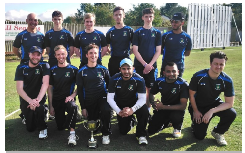
Didsbury 3s, double winners in 2018