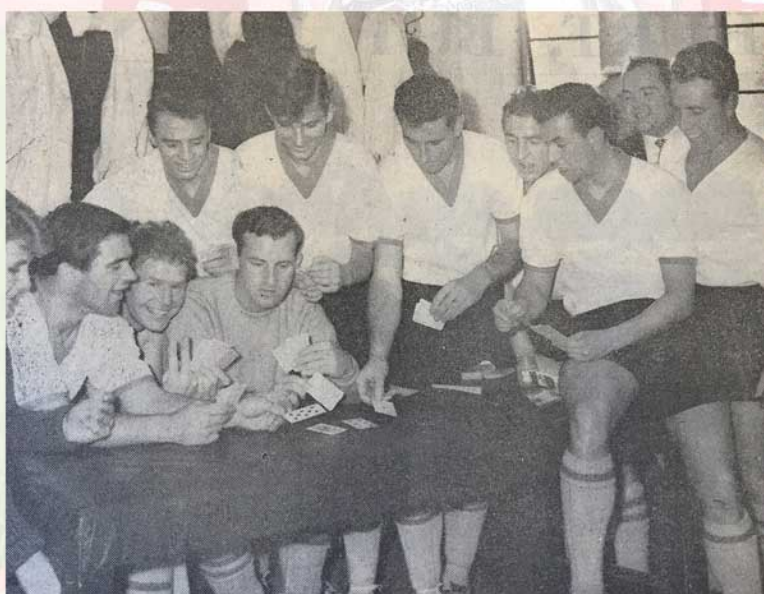
The team playing cards before the game.