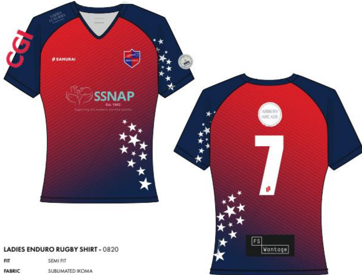
LADIES ENDURO RUGBY SHIRT - 0820

FIT SEMI FIT FABRIC SUBLIMITED IKOMA COLLAR OPTIMAX