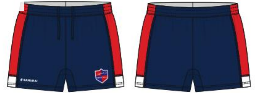
LADIES PREMIER SHORT - BESPOKE DESIGN

FIT SEMI FIT FABRIC SUBLIMITED IKOMA COLLAR OPTIMAX