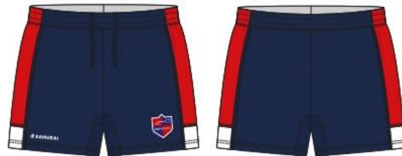
PREMIER SHORT - BESPOKE DESIGN

FIT REGULAR 4" INSEAM LEG FABRIC CUT&SEW POLYESTER DRILL FABRIC