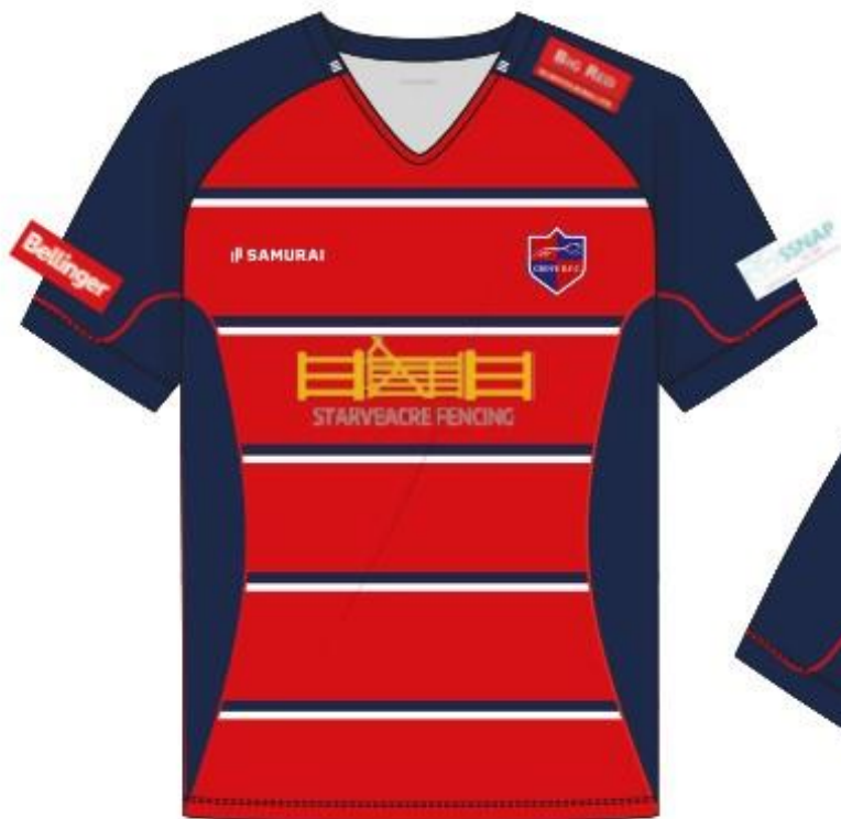
ENDURO RUGBY SHIRT - DESIGN 5414

FIT ATHLETIC FABRIC SUBLIMATED IKOMA COLLAR OPTIMAX