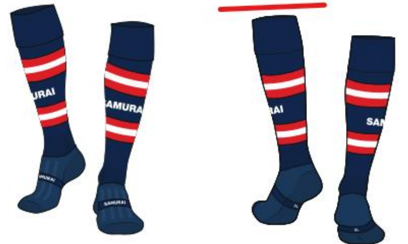
PREMIER SOCK - SO9

FIT REGULAR 3" INSEAM LEG FABRIC CUT&SEW POLYESTER DRILL FABRIC