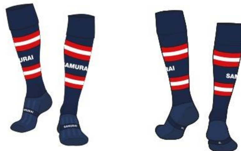
PREMIER SOCK - SO9

FIT REGULAR 4" INSEAM LEG FABRIC CUT&SEW POLYESTER DRILL FABRIC