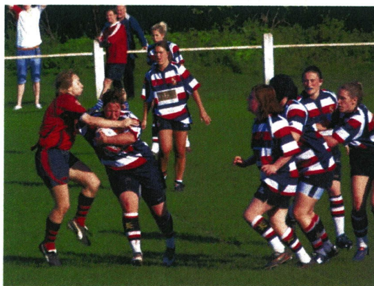
Action from the Women's game against Lakenham Hewitt