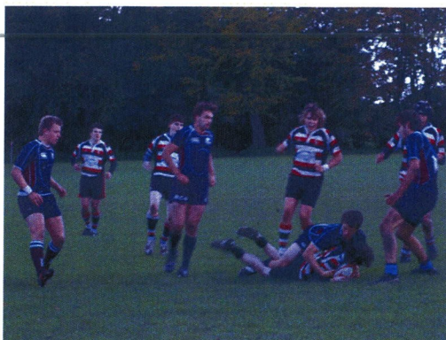
AK's final try in the Senior Colts game v Wilmslow