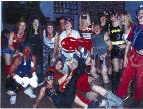
AK's shy, quiet and retiring Women's Team

Heroes and Villains Night: This event took place at AK on 13 th Nov, and turned out to be a great night for those attending as can be seen from the photos below. We even had a guest appearance from the Chilean miners! A net profit of around £1000.00 was made, which moves the development barometer up another notch.