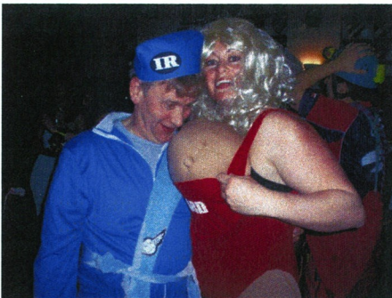
Definitely one for some red eye reduction!