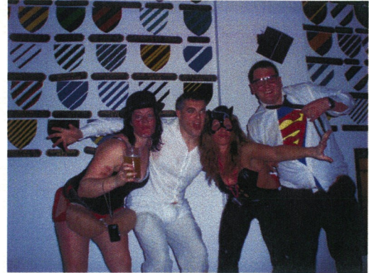
Auditioning for 'Britain's got talent'