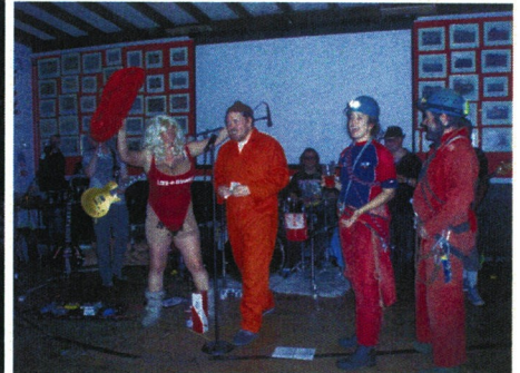
Best costume competition: Baywatch babe and Chilean Miners

There are lots more photos on the AK website, and another similar event will probably be planned for March 2011 (details to follow in due course). So NO EXCUSES next time, get down, enjoy the night and support the future development of your club