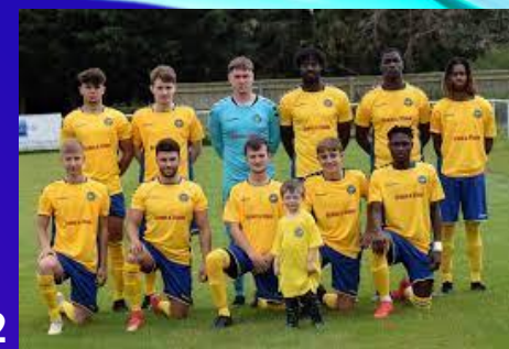
AUFC - 2021/22

The club was formed in 1946 when a group of ex-service men decided that the town could support two football clubs. The first meeting to form the club was held in the local Anchor Public House on the bank of the River Thames. The new club joined Division 1 of the North Berks League for the 1946/47 season and whilst being relegated, they went onto win the leagues Charity Shield at their 1st attempt.