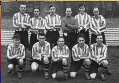
AUFC - 1946/47