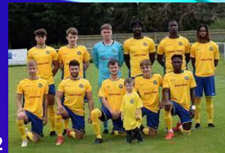
AUFC - 2021/22

The club was formed in 1946 when a group of ex-service men decided that the town could support two football clubs. The first meeting to form the club was held in the local Anchor Public House on the bank of the River Thames. The new club joined Division 1 of the North Berks League for the 1946/47 season and whilst being relegated, they went onto win the leagues Charity Shield at their 1st attempt.