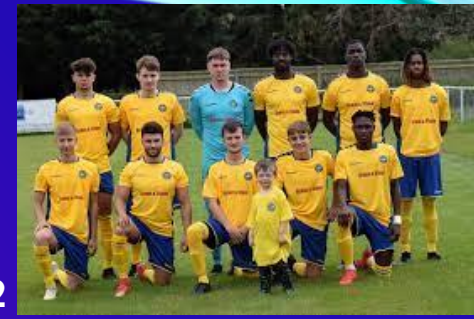
AUFC - 2021/22

The club was formed in 1946 when a group of ex-service men decided that the town could support two football clubs. The first meeting to form the club was held in the local Anchor Public House on the bank of the River Thames. The new club joined Division 1 of the North Berks League for the 1946/47 season and whilst being relegated, they went onto win the leagues Charity Shield at their 1st attempt.