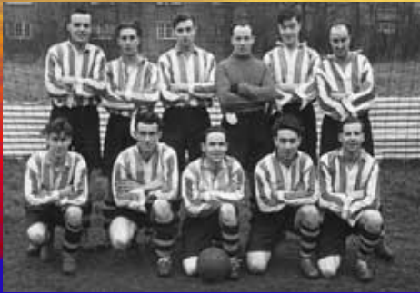
AUFC - 1946/47