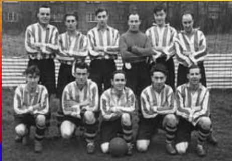
AUFC - 1946/47