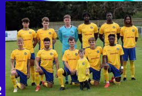
AUFC - 2021/22

The club was formed in 1946 when a group of ex-service men decided that the town could support two football clubs. The first meeting to form the club was held in the local Anchor Public House on the bank of the River Thames. The new club joined Division 1 of the North Berks League for the 1946/47 season and whilst being relegated, they went onto win the leagues Charity Shield at their 1st attempt.