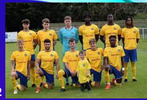
AUFC - 2021/22

The club was formed in 1946 when a group of ex-service men decided that the town could support two football clubs. The first meeting to form the club was held in the local Anchor Public House on the bank of the River Thames. The new club joined Division 1 of the North Berks League for the 1946/47 season and whilst being relegated, they went onto win the leagues Charity Shield at their 1st attempt.