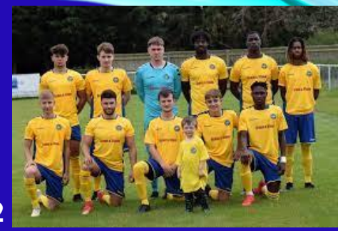
AUFC - 2021/22

The club was formed in 1946 when a group of ex-service men decided that the town could support two football clubs. The first meeting to form the club was held in the local Anchor Public House on the bank of the River Thames. The new club joined Division 1 of the North Berks League for the 1946/47 season and whilst being relegated, they went onto win the leagues Charity Shield at their 1st attempt.