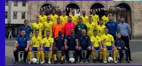
AUFC - 2022/23

The club was formed in 1946 when a group of ex-service men decided that the town could support two football clubs. The first meeting to form the club was held in the local Anchor Public House on the bank of the River Thames. The new club joined Division 1 of the North Berks League for the 1946/47 season and whilst being relegated, they went onto win the leagues Charity Shield at their 1st attempt.