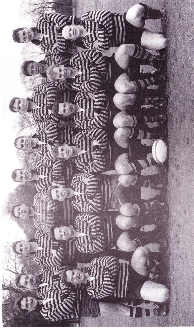
EDINBURGH NORTHERN R.F.C. 1st XV 1993-94