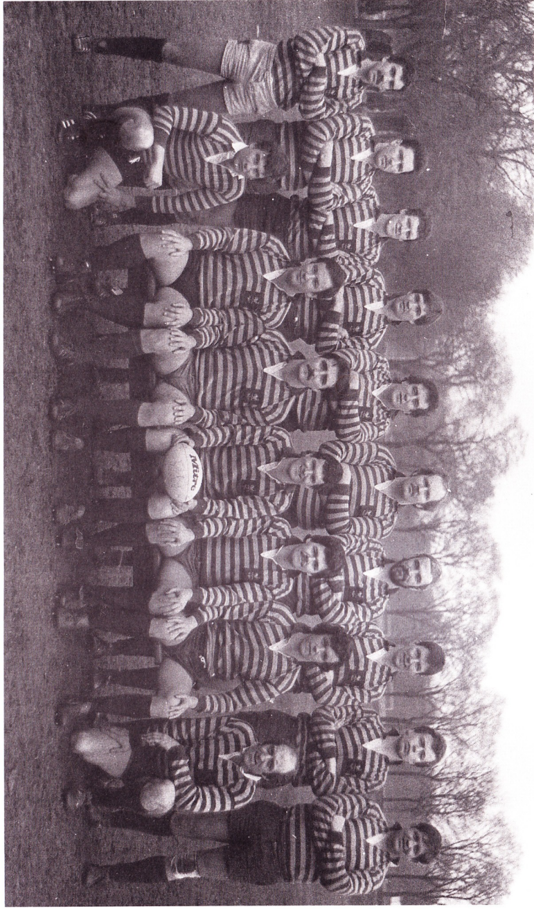
EDINBURGH NORTHERN R.F.C. 1st XV 1982-83