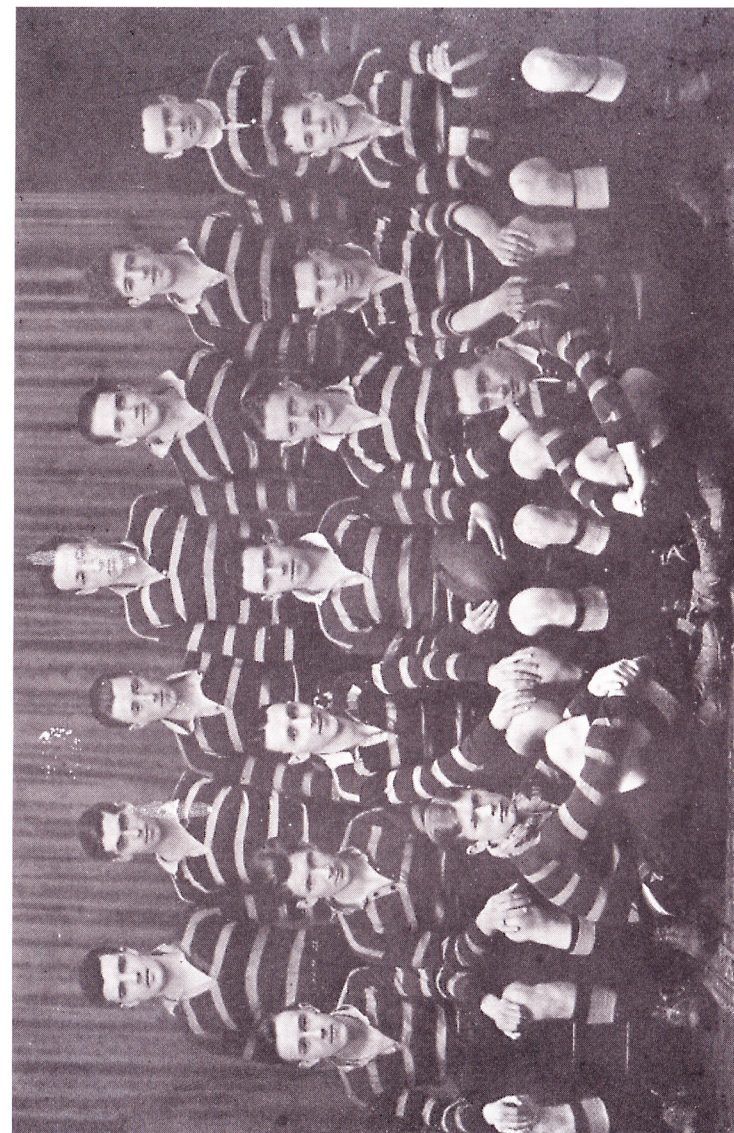
EDINBURGH NORTHERN R.F.C. 1926

At our AGM in March 1939 the club office bearers could not have guessed that the next season they would have a different job to do. War came, club funds were frozen and by and large junior rugby came to a halt.