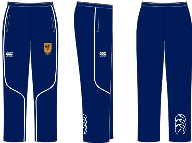
CLUB TRACK PANT