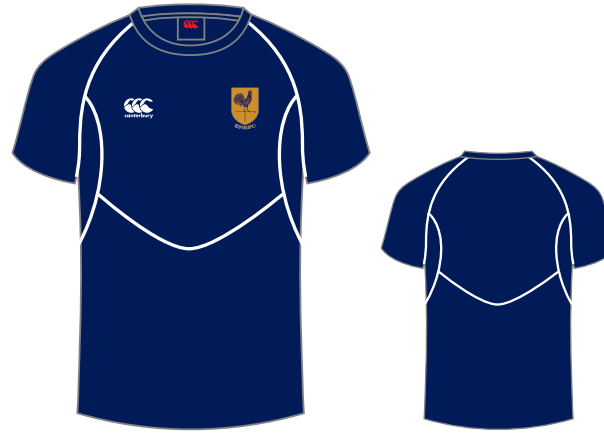
CLUB DRY T-SHIRT