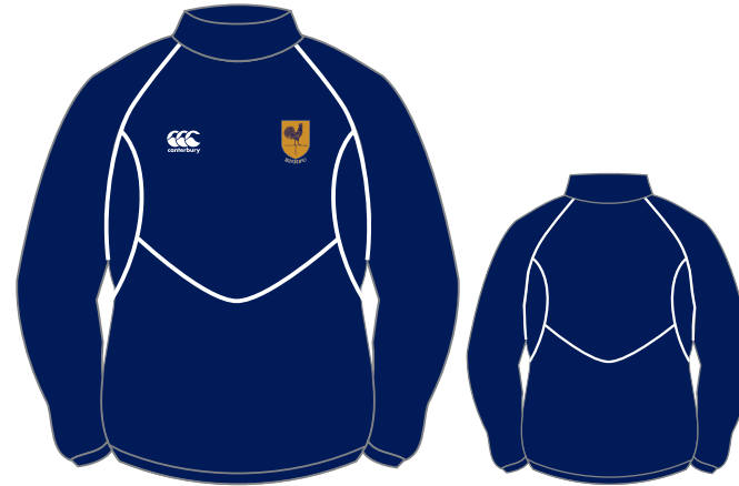
COLD LONG SLEEVE TOP