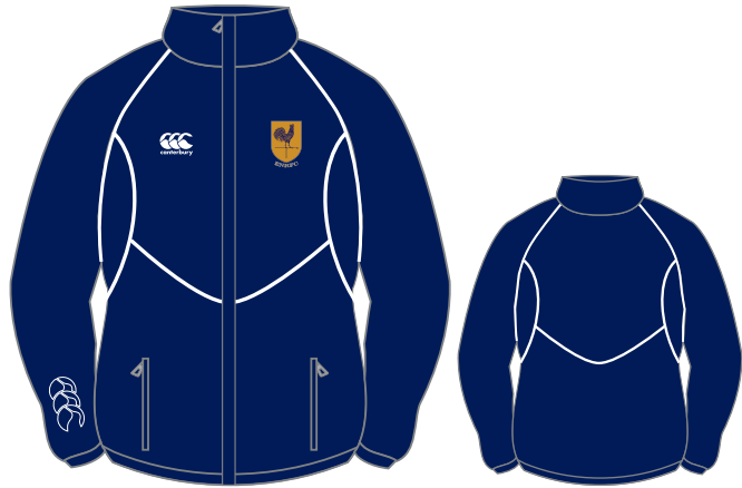
CLUB TRACK JACKET