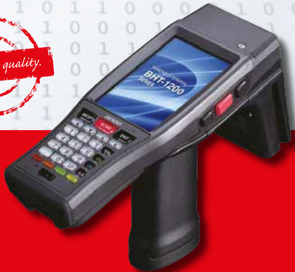
RFID Handheld Terminal