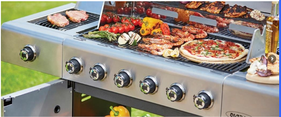
THE NATIONS FAVOURITE BARBECUE