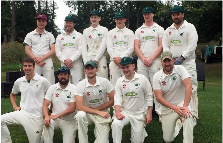
1st XI 2019