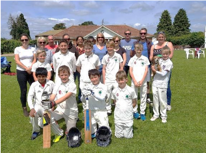
The talented Under 11 squad with parents