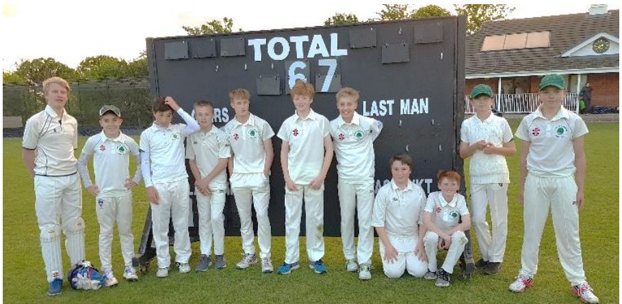
The Under 13 team after an outstanding win