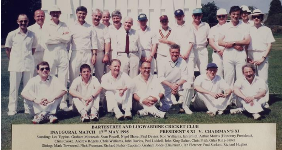
First ever match – Chairman's XI v. President's XI, May 1998