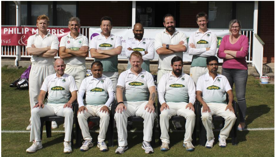
Bartestree and Lugwardine CC 2nd XI 2021