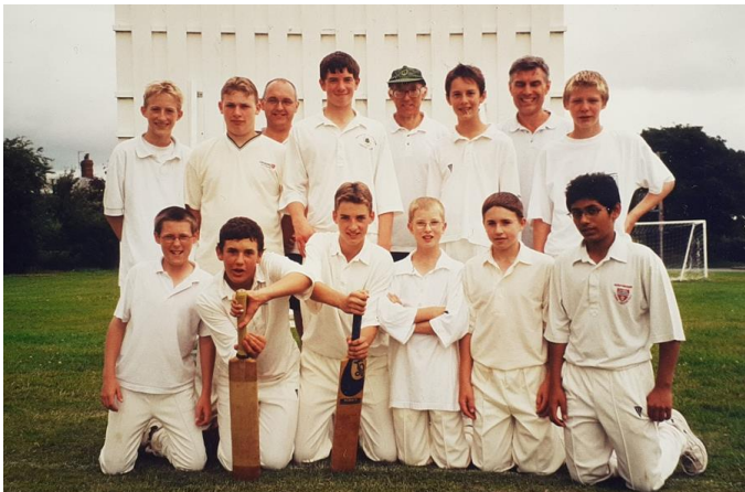
First Under 15 team 2001