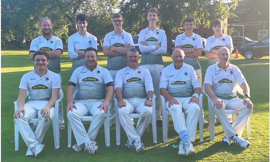
Bartestree and Lugwardine CC 3rd XI 2021