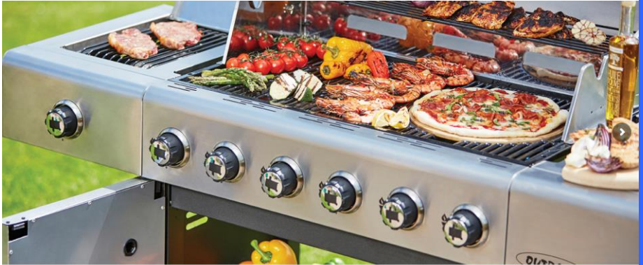
THE NATIONS FAVOURITE BARBECUE