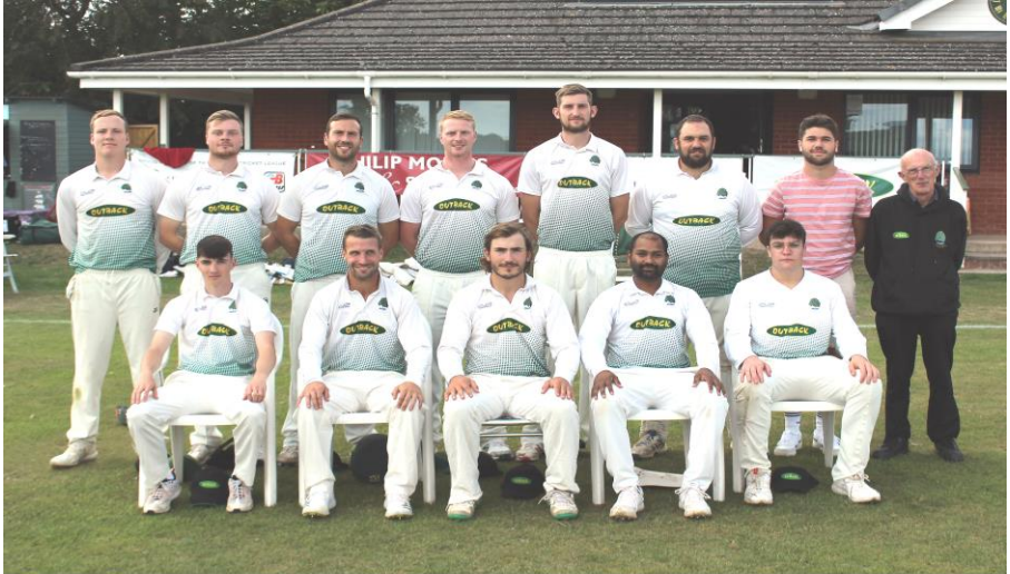
Bartestree and Lugwardine CC 1st XI 2021