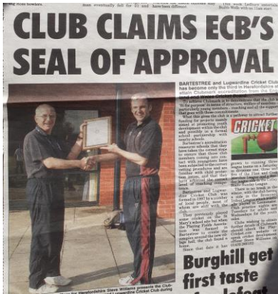
First Club Mark award, 2006