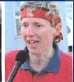
Scat responds positively when asked if she is ready for the challenge ahead!