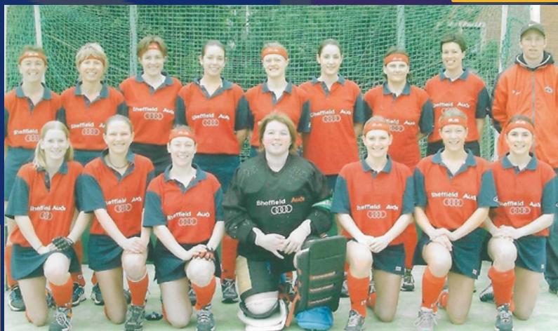
The 1st Team on their 2003 League win & promotion.

It's hard to believe looking back now that the Men's and Women's clubs actually only came together formally under Sheffield Hockey Club ahead of the 02/03 season. Lots of work and planning went into this change and the Executive Committees of both sections are to be thanked. Although this marked the end of SLHC as an entity in its own right, ladies hockey has continued at the Dale under the new structure and we're still counting the years.