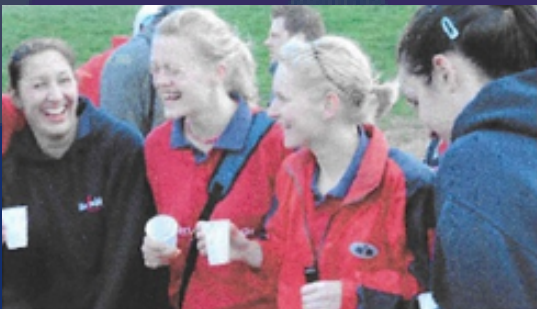
Post match warm-down and fluid replacement session

For the record, we secured 18 wins, 4 draws and 0 losses from 22 matches. So often the North League runners up, Sheffield could now look forward to joining the teams who had beaten them to the post over the last 5 years!