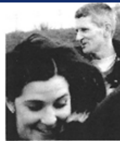
Cox assures Roachie that she will start training next week!