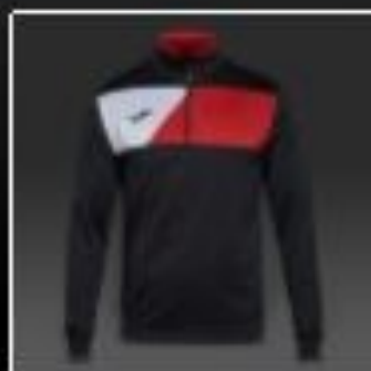
Joma 1/4 Zip Fleece