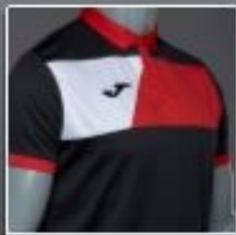
Joma Polo Shirts