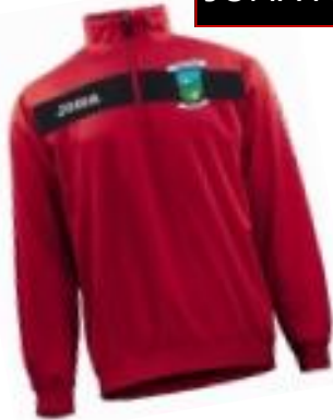
JOMA Academy Collection Fleece Training Top

Items available include official Club Training Wear and Replica Kit