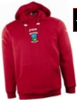
JOMA Academy Collection Hoodie