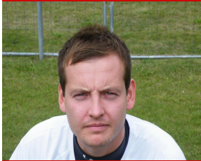
RICHARD SHELLEY HOME