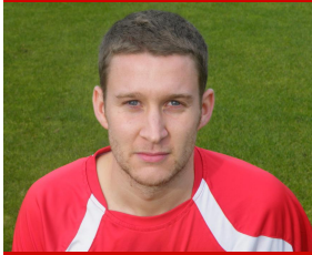
DAN COX HOME