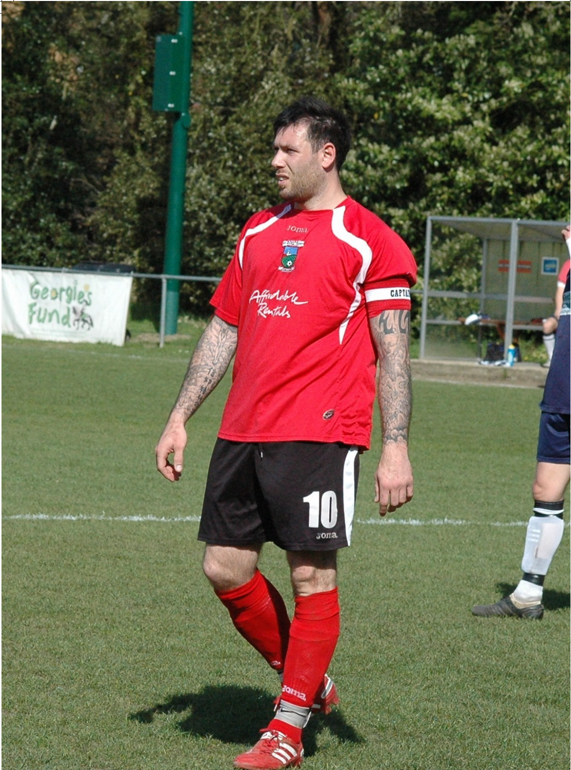
8 - KNAPHILL FC