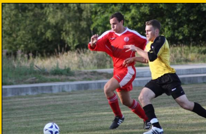
Pre-season action vs Mole Valley SCR