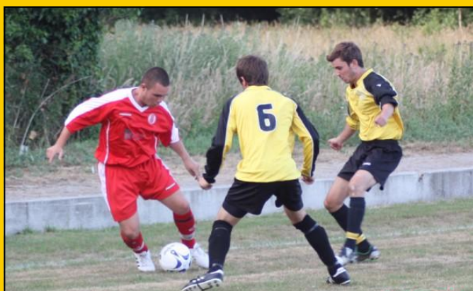
Pre-season action vs Mole Valley SCR