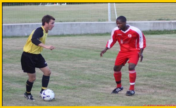
Pre-season action vs Mole Valley SCR