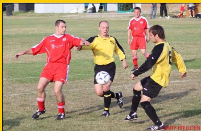
Pre-season action vs Mole Valley SCR