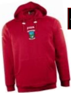
JOMA Academy Collection Hoodie