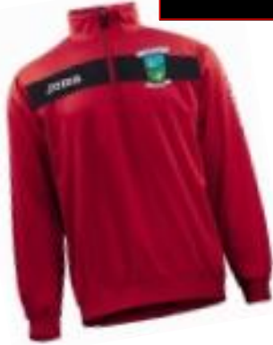
JOMA Academy Collection Fleece Training Top

Items available include official Club Training Wear and Replica Kit