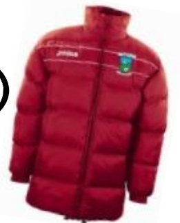
JOMA Academy Collection Bench Jacket