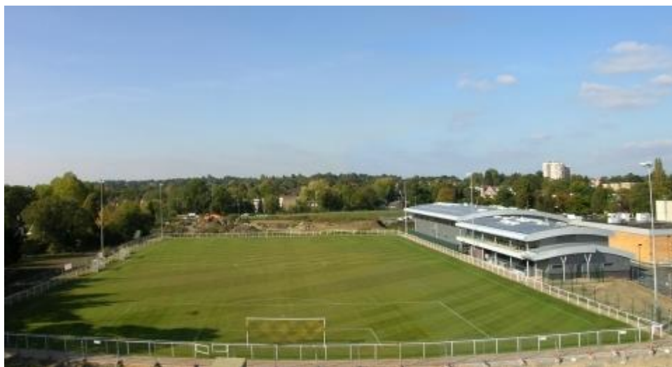
Westfield's impressive new home ground

Following the installation of floodlights in 1998 the U18 team joined the Southern Youth Floodlight League as members of the Western Division. The Club also run an U16 team playing in the West Surrey Youth League.