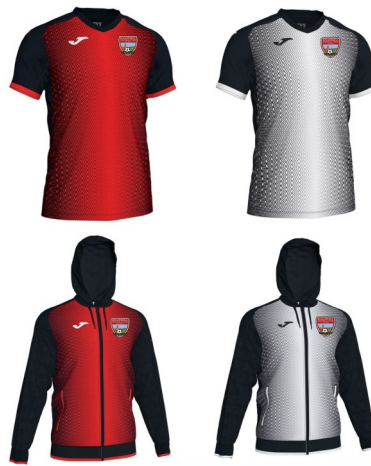
KNAPHILL FC JOMA HOODY & SWEATSHIRT 19/20