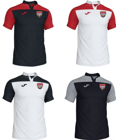
KNAPHILL FC JOMA MATCHDAY POLO SHIRTS 19/20