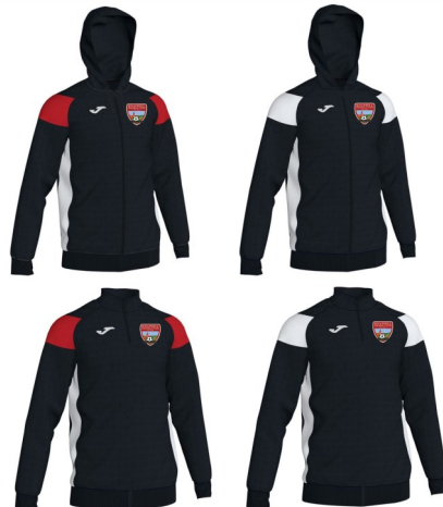
KNAPHILL FC JOMA HOODY & SWEATSHIRT 19/20