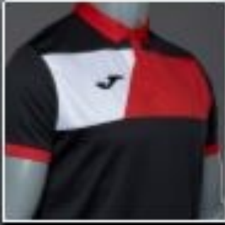
Joma Polo Shirts