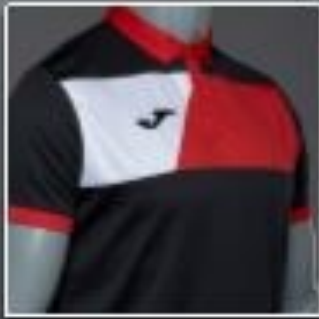
Joma Polo Shirts