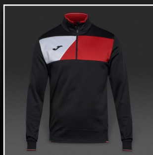
Joma 1/4 Zip Fleeces