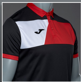
Joma Polo Shirts