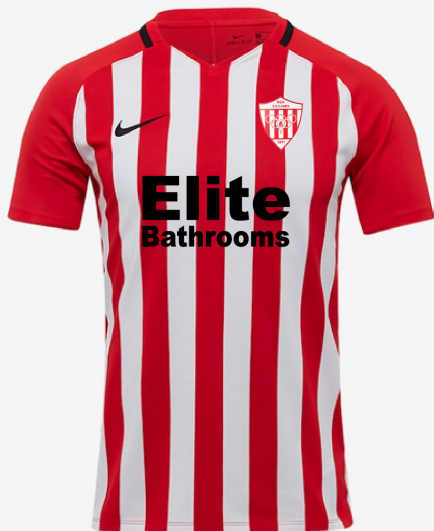
HOME TEAM KIT