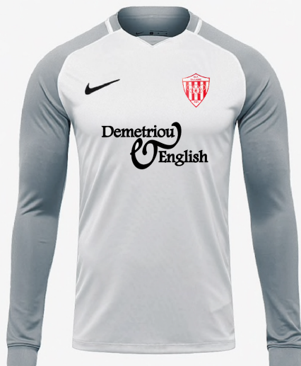
AWAY TEAM KIT