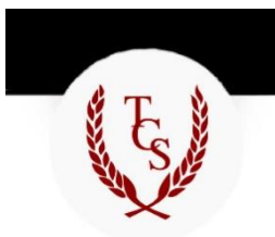
T.Cribb & Sons Ltd