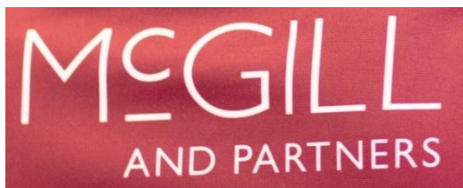
McGill and Partners