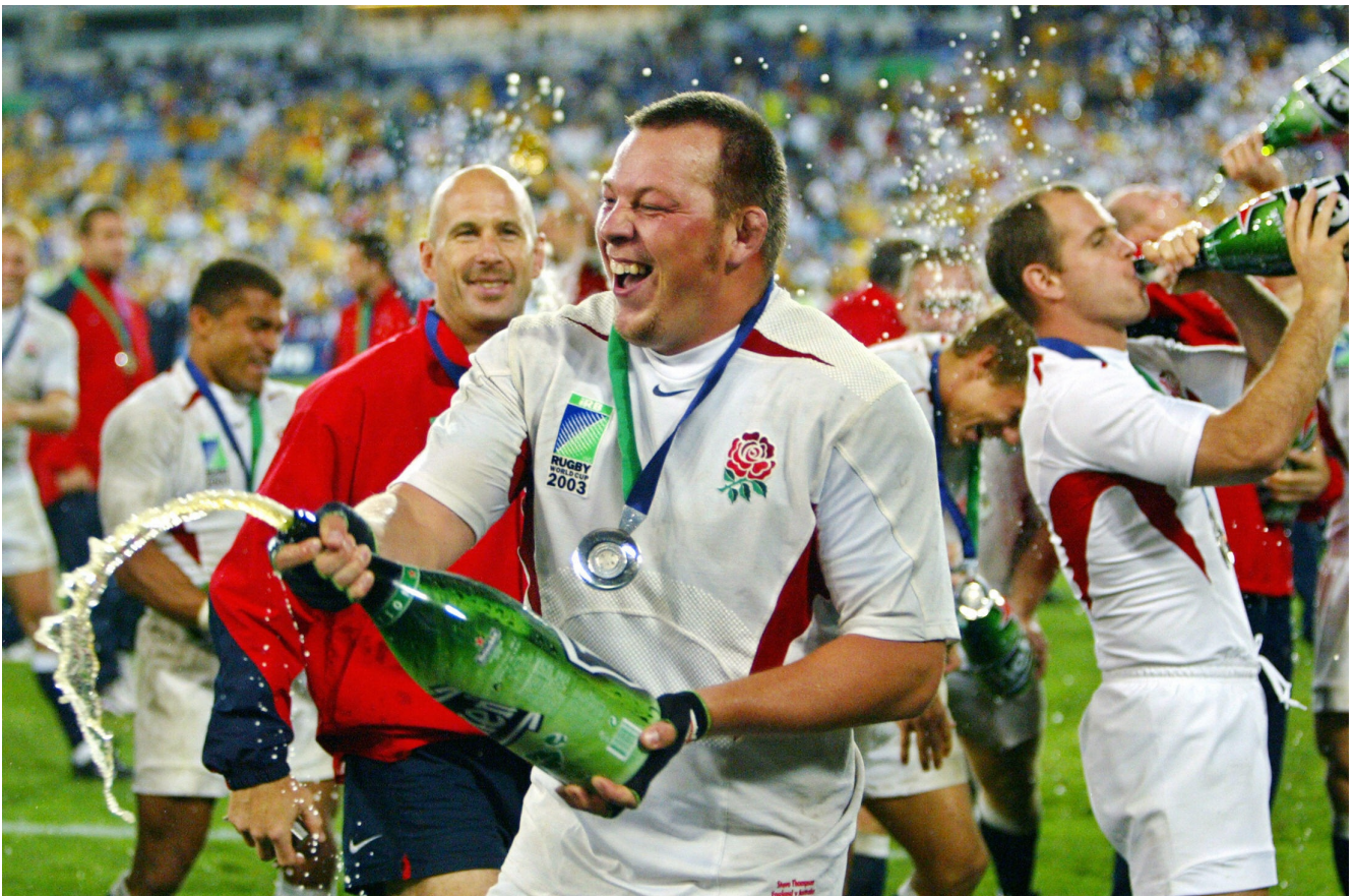
English hooker Steve Thompson had little recollection of winning the Rugby World Cup in Sydney in 2003.