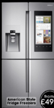
American Style Fridge Freezers