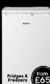
Fridges & Freezers