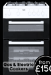
Gas & Electric Cookers