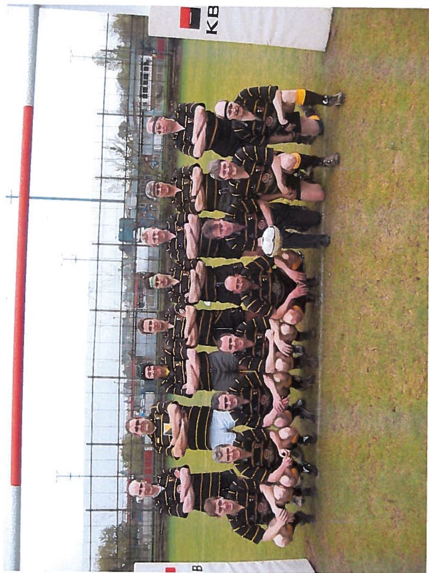
London Cornish Vets v Old Tottonians Prague 2006