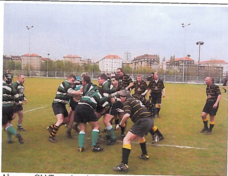
Above: v Old Tottonians in Prague. Our hotel in the background Below: Fletch is last to fall down in another game of Humpty Dumpy v Oxpo