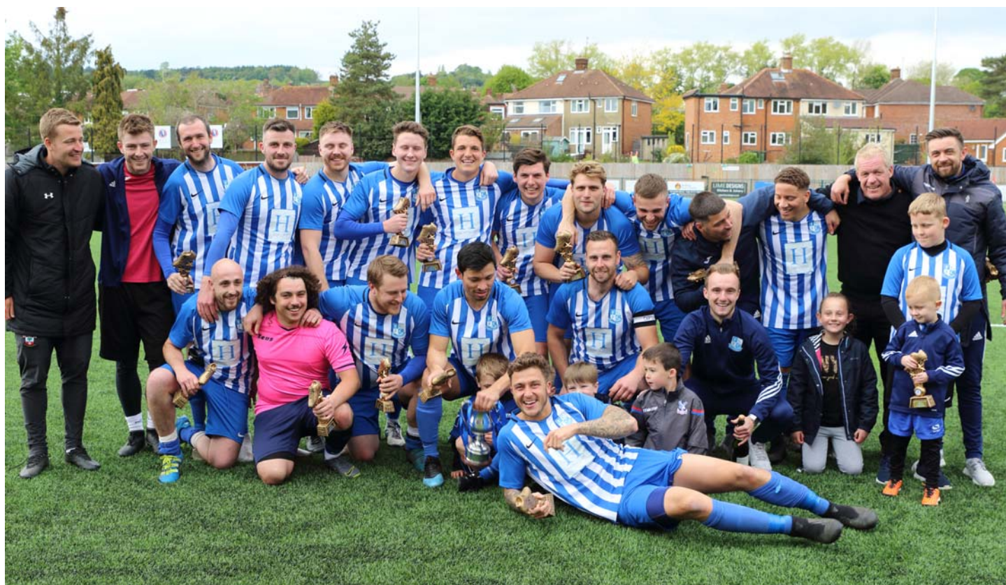
Frimley Green celebrating after winning the Esoteric Records Division One Challenge Cup at Meadowbank, Dorking