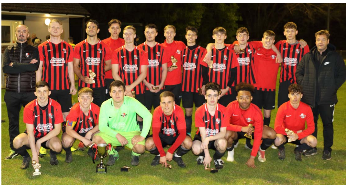
Cobham U23's, after winning the John Bennett Development Division Challenge Cup at South Park FC