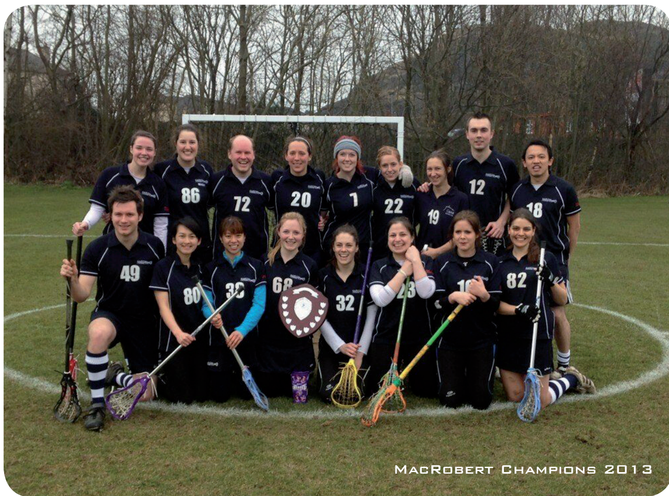
MACROBERT CHAMPIONS 2013