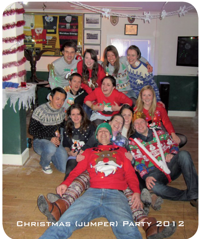
CHRISTMAS (JUMPER) PARTY 2012

CAPITAL IS ONE OF TWO MIXED LACROSSE CLUBS IN EDINBURGH, AND ARGUABLY ITS FAVOURITE - THOUGH THAT VIEW MIGHT BE A LITTLE BIASED!?