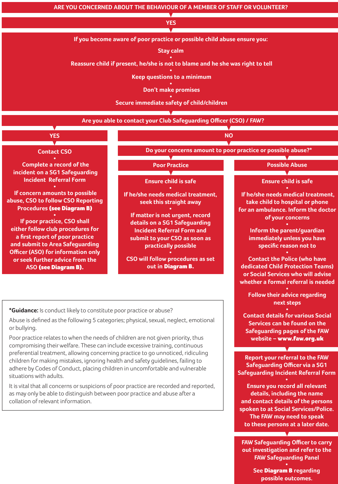
Diagram A: Reporting and Managing Poor Practice or Possible Abuse (in relation to concerns about a member of staff or volunteer within football)