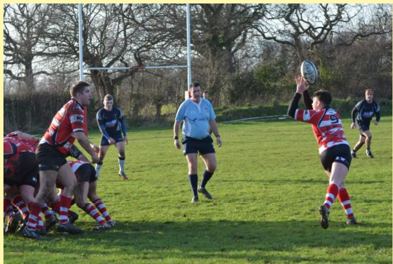
Rhyl v Colwyn Bay