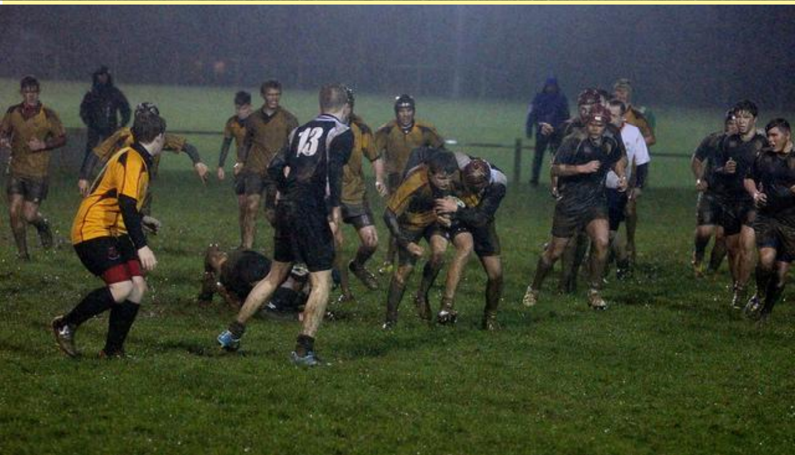
RGC WEST U15 v RGC EAST U15 by Tom Last