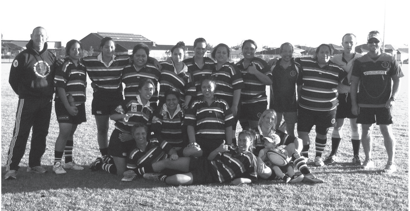
Southern Lions women's team ( the Lionesses )

Women's - In 2012 SLRUFC competed in the Women's competition for the first time since 2005. The picture below is from their first league game against Rockingham. The team improved out of sight over the year and look forward to 2013 with growing confidence in their ability to win games and make the finals. Thanks ladies for being a great addition to the Southern Lions RUFC. Keep up the singing!!