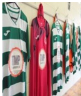
Cyrus Thorpe Sponsored by East of England Training