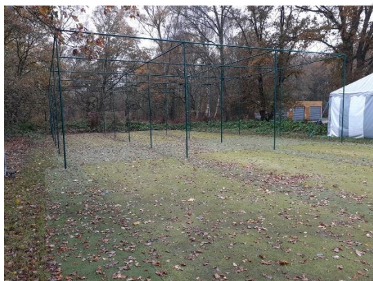
Albury – 3 lane net