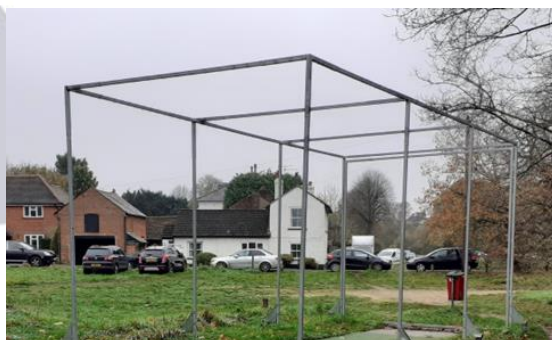
Shalford – 1 lane net