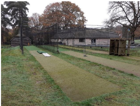
Blackheath – 3 lane net