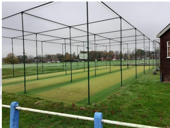
Cranleigh – 3 lane net