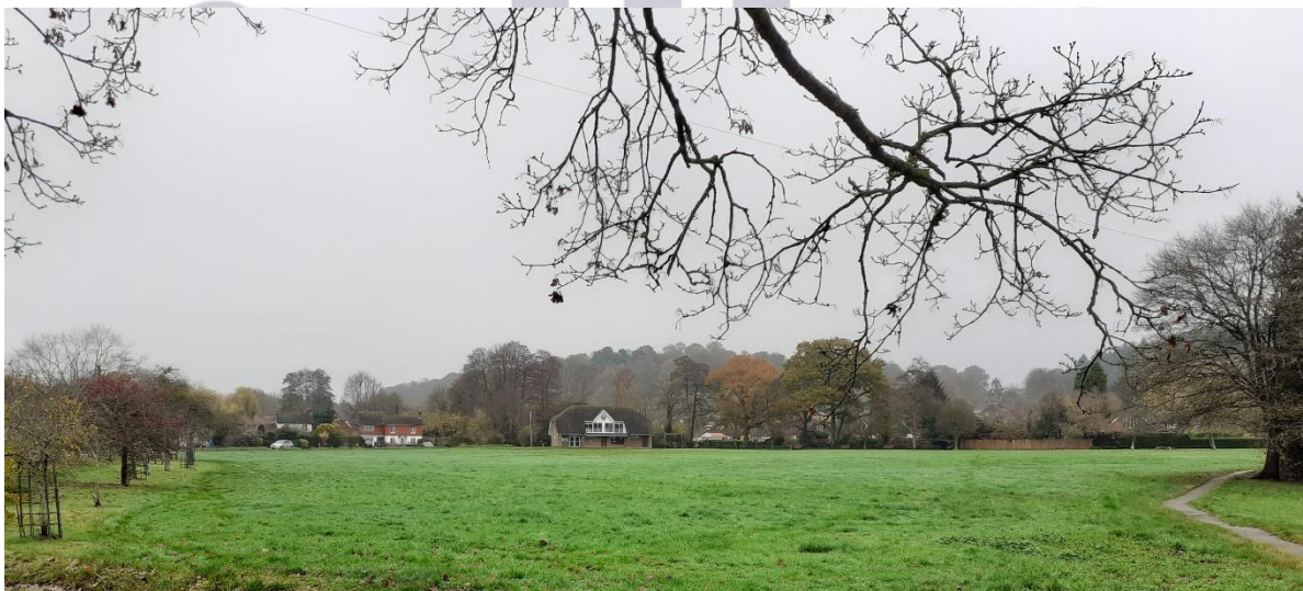
View from the proposed location towards the Pavilion.

The visual impact of this location is reduced by the trees which are growing along Wonersh Common road and along the path crossing the Common.